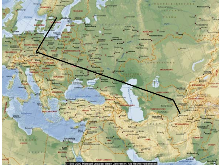
Figure 2: The distance from Kabul to Oslo is more than 6000 km, in part over mountainous and deserted areas.

The third day post trauma the patient was evacuated from Kabul. He was first taken to Termez in Uzbekistan by a C160 Transall transport plane with intensive care capacity. In Termez the patient was transferred to a German Airbus A310 Multi Role Transporter and flown to Oslo, Norway (figure 2).