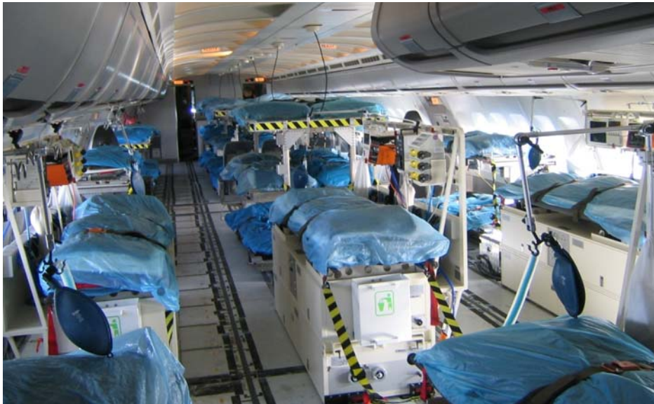
Figure 4: The Air Force Airbus A310 Multi Role Transporter equipped for intensive care treatment can carry 44 patients, 6 on ventilator treatment.

On the night of arrival in Oslo angiography revealed no ongoing hemorrhage. At relaparotomy the packing was removed, the wounds revised. Repeated wound revisions were necessary. The entry and exit wounds were left to granulate. He suffered infectious complications and pulmonary insufficiency. There was biliary leakage. He spent three weeks under intensive care and was discharged after two months. He is now rehabilitated (figure 5).