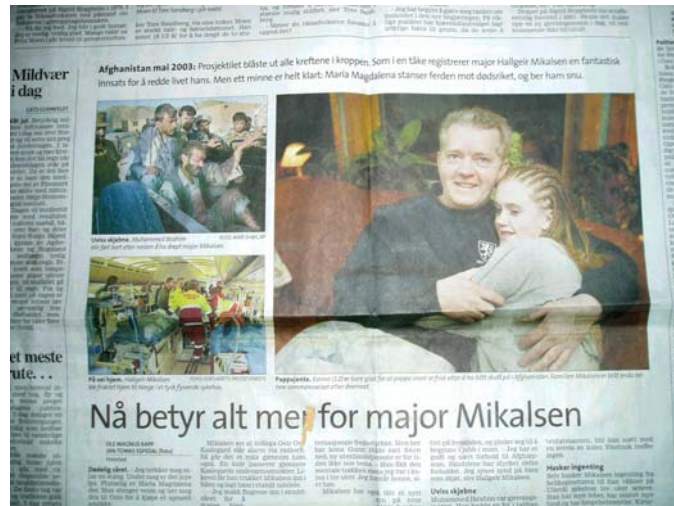
Figure 5: In a newspaper interview six months post trauma the patient expressed the wish to volunteer for a new mission, although discouraged by his spouse and daughter.

With training and an understanding of the importance of early hemostatic damage control surgery and backed by an organization equipped and staffed for strategic evacuation of intensive care patients, critical combat casualties may be given treatment on the level of western urban trauma care.