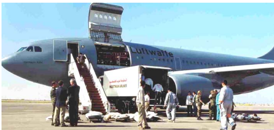
Figure 3: The German Air Force Airbus A310 Multi Role Transporter has a range of 9540 km and can evacuate patients to virtually any destination in the world. It is available at any time.

The Airbus 310 has the capacity of lifting 44 patients in a whole, 6 of them under intensive care ventilator therapy and the rest under intensive care monitoring and treatment. The plane is staffed with 25 nurses and doctors (figure 3 and 4]. From Oslo Airport to Ullevål University Hospital the patient was transported in an intensive care ambulance staffed and equipped for all types of intensive care including extracorporeal circulatory support.